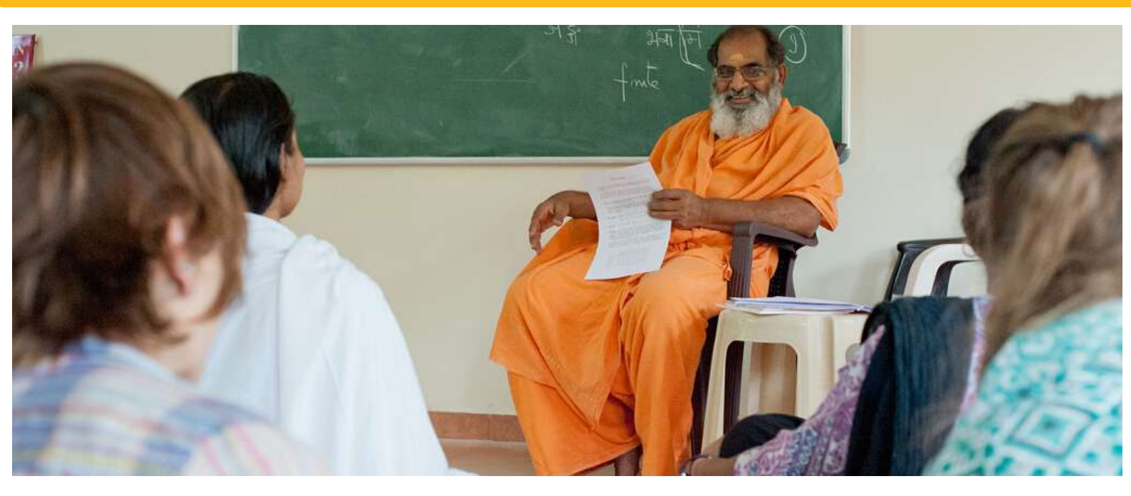
Vedānta - Spiritual Learning Programme

Purna Vidya Ashram, Coimbatore. 8-Nov - 8-Dec, 2019