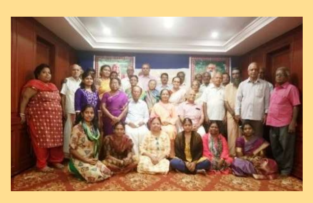
Volunteers meet up