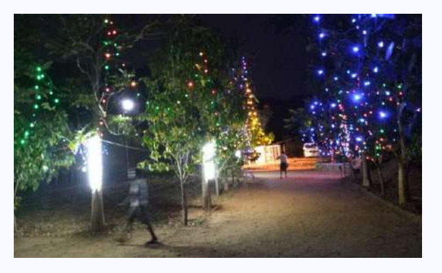
Ashram prepared for the celebrations