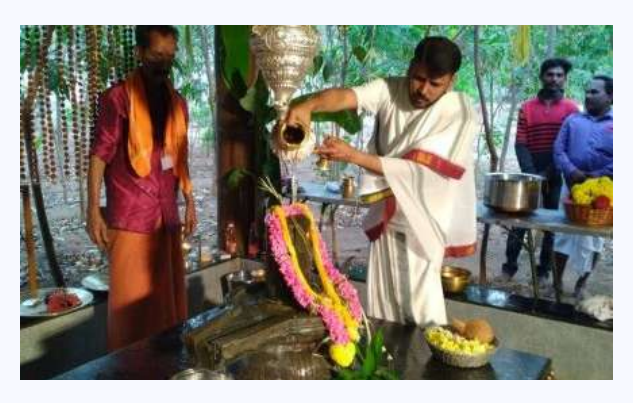
Arulji performing puja