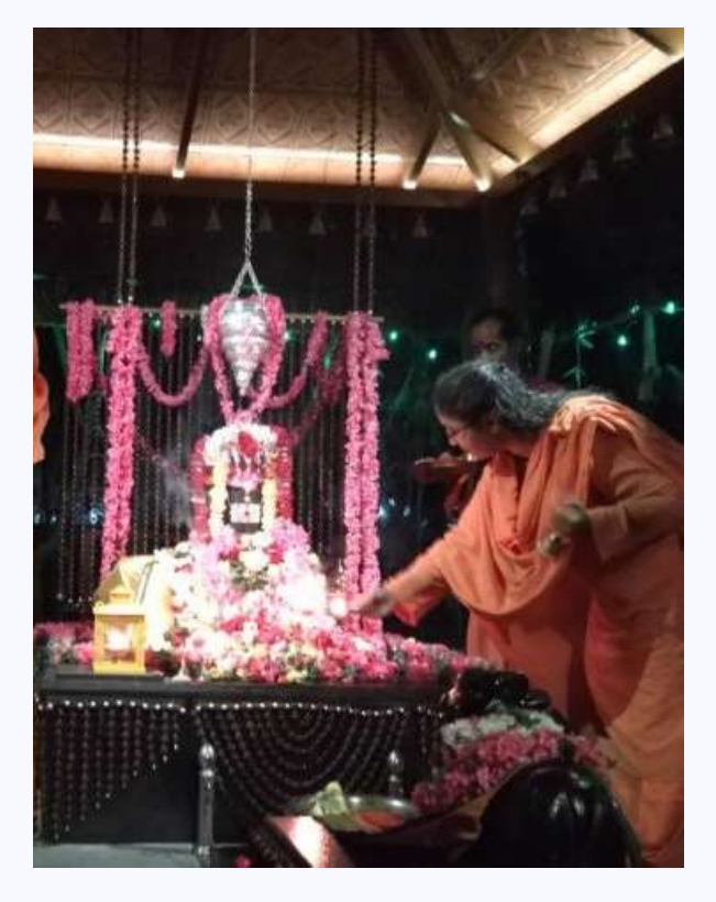
Ammaji offering arati