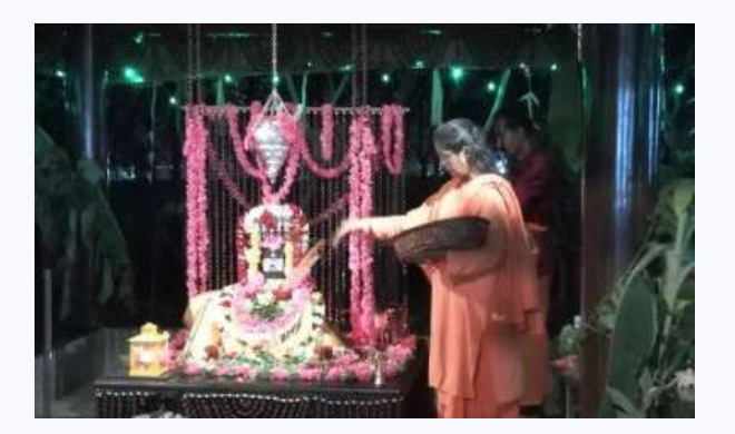
Ammaji offering pushpam

Mahāśivarātri, the great night of Lord Śiva, was celebrated with much devotion and grandeur this year. The Rudra abhiśekams for Lord Śri Vanalingeswar were accompanied by chanting and bhajans round the clock right into the next day. The dynamic participation of around 500 devotees including people from neighbouring villages and towns certainly rendered this night grand and memorably befitting for our Lord of all puruṣarthās!