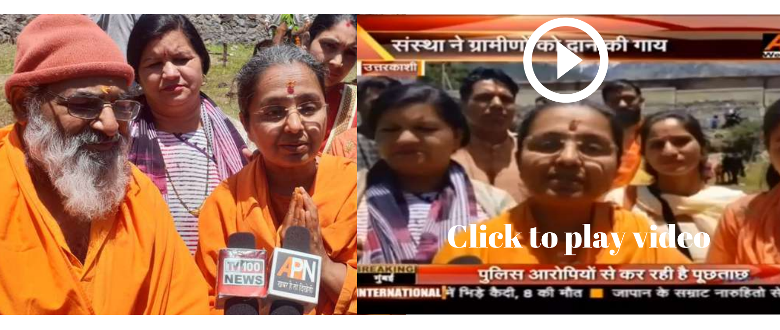
Go-danam on May, 2019 at Uppala Taknaur Patti of Gangotri Kshetra, Himalayas

Purna Vidya's Relief work in Natural Disasters in the Himalayas found yet another avenue to reach out and serve the villagers in kindness and love this winter of 2018-2019. Seven villages of the Gangotri Valley saw a huge calamity which went totally unnoticed and neglected by one and all! The heavy snowfall, lack of fodder, and absence of Sunlight for over two and a half months saw the death of over 80 cows in each of the seven villages of Uppala-Takhnaur-Patti of Gangotri Kshetra. These Himalayan villages namely Sukki, Jaspur, Purali, Jhala, Cholmi, Dharali and Mukhva which are over 3000 meters in height above sea-level were badly affected by this major calamity. The only source of livelihood which is 100% agriculture holds cows and bulls as essential part of life. The reverence with which the simple faithful villagers protect their milch-cows and old non-milch cows as part of their family, taking care of them till their death is worth a mention.