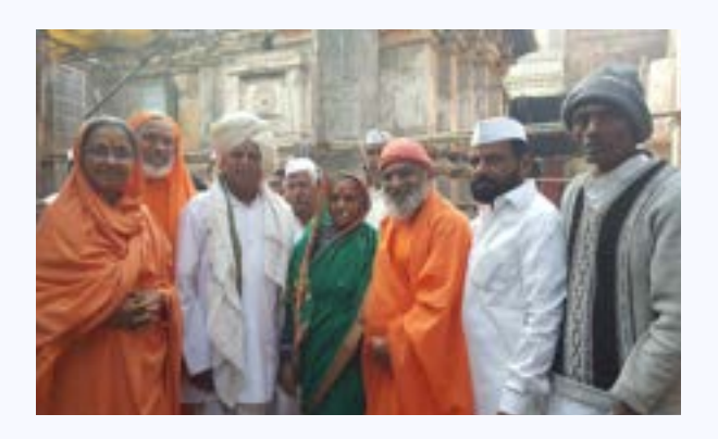
With a Charming Maharashtran Couple in Alandi