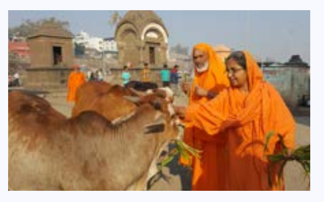
Ammaji takes great delight showing her love to the cows