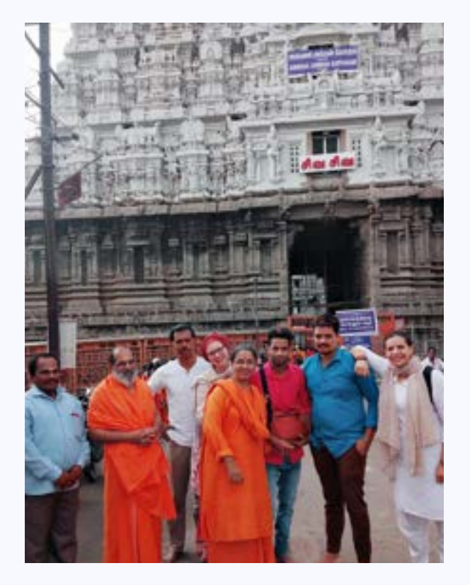
In front of Tiruvannamalai Temple